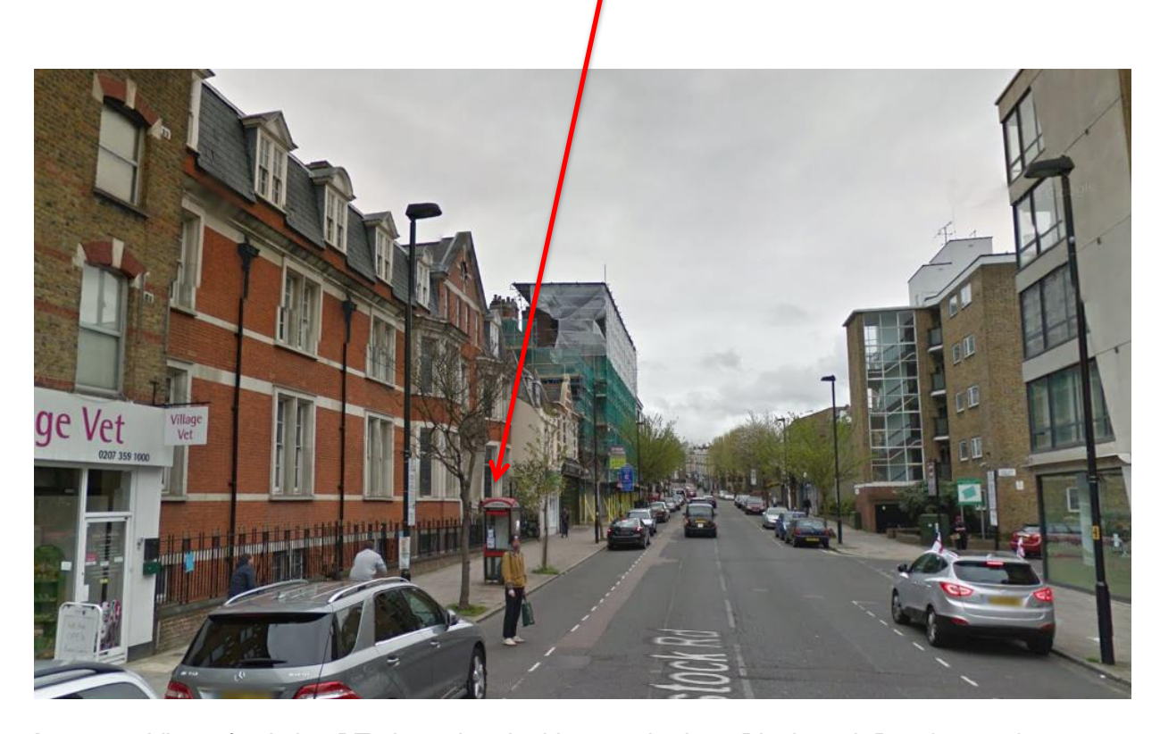
Image 3: View of existing BT phone box looking south along Blackstock Road towards Riversdale Road