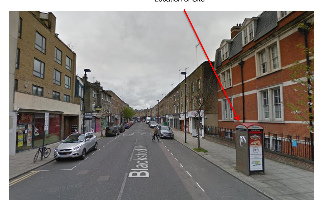
Image 2: View of existing BT phone box looking north along Blackstock Road towards Mountgrove Road