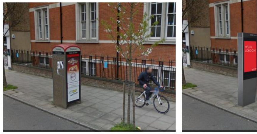
Images 4 and 5: Existing Photograph of Site and Proposed CGI Views of Site